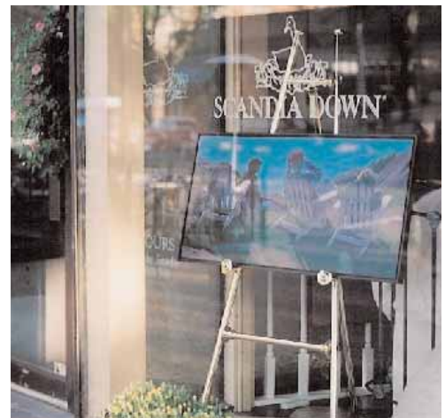
A painting by artist Neil Scollan on display in the front window of Scandia Down.