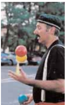
The juggler entertained the audience during the evening kick-off reception.