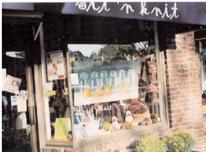
An oil painting by Diana Dash in the window of Sit n' Knit.